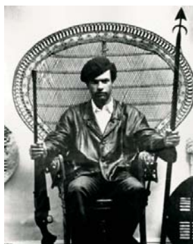
1966 Black Panther Party created